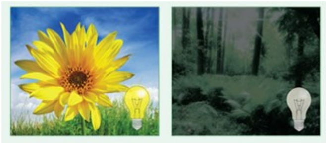
Bright scene ~ 100% power consumption

Dynamically adjusts the brightness and power consumption