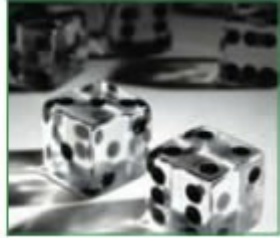
15,000:1 Contrast Ratio